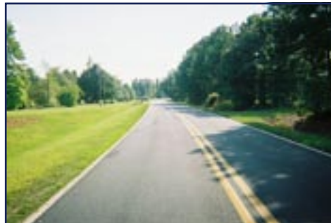
How do you envision Spalding County in the future?