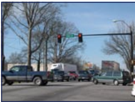
The Village Node concept will focus development and growth.

The village nodes are intended to be pedestrian-friendly, neighborhood centers. Most of these villages are located at historic crossroads communities with historic structures that could be incorporated into the new villages, which would add such uses as grocery stores, drug stores, barber shops, restaurants, and dry cleaners. Appropriate civic uses might include elementary schools, parks, fire stations, libraries and community centers.